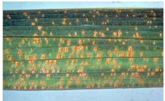
Image on the right courtesy of Central Science Laboratory, Harpenden Archive, British Crown, www.bugwood.org , #0656091

Image on the left courtesy of Cesar Calderon, USDA APHIS PPQ, www.bugwood.org , #2173056