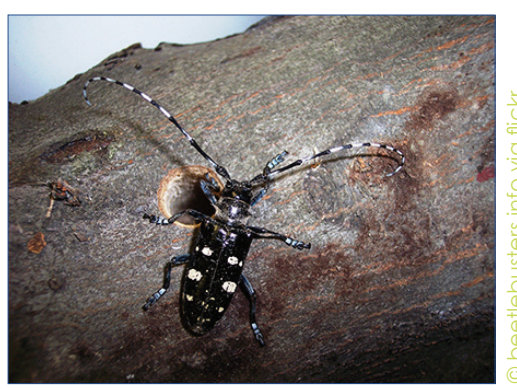
Adult beetle with exit hole.

The most important thing you can do to protect your trees is to check them regularly and encourage others to do so, too. Early detection is crucial in the fight against this invasive pest. Residents are encouraged to check their trees, report any sightings of the beetle or signs of damage that it causes, or notify the program if any trees or tree debris has been moved from their properties.