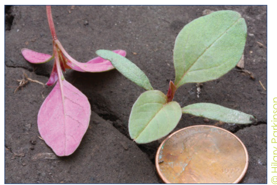
Figure 1. Redroot pigweed, Amaranthus retroflexus, demonstrating linear cotyledon leaf shape, first true leaves and red leaf underside (a helpful diagnostic feature).

The weed seedling guide provides information on 73 species, including 60 forbs (broadleaf) and 13 grass species. Each species includes a photo of the cotyledon leaves, first true leaves (Figure 1), rosettes (where applicable), mature plants and seeds. Color coding, and icons indicate whether the plant is primarily cropland or rangeland, life cycle, leaf arrangement and cotyledon shapes (forbs); and ligule characteristics (grasses).