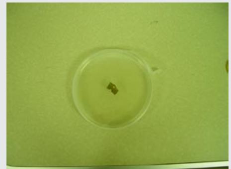
Figure 1 and 2. Double-sided tape is placed on the cover a Petri dish (top). The leaf of interest is attached to the Petri dish cover so that the sporulating side faces the agar (bottom).