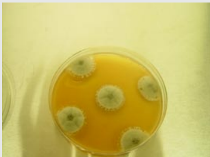
Figure 3 and 4. Spores or single colonies can be transferred to a new agar plate (top). Pure culture colonies from single conidial isolates (bottom).