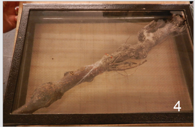
Figs 1, 2, 3. Cankers of chestnut blight (Cryphonectria parisitica). Fig 4. Southern blight (Sclerotium rolfsii) on the trunk of a young apple tree.