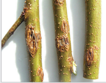
Chalara fraxinea symptoms on Fraxinus excelsior.