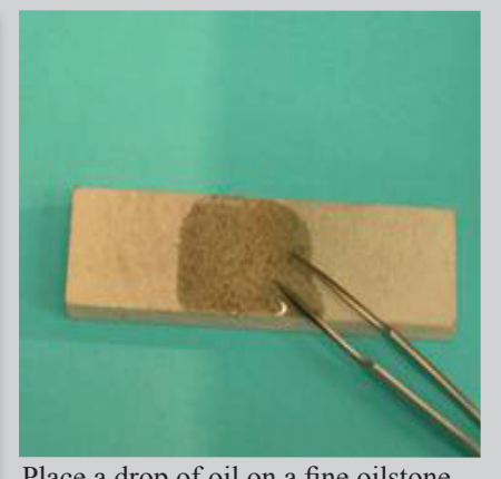
Place a drop of oil on a fine oilstone.