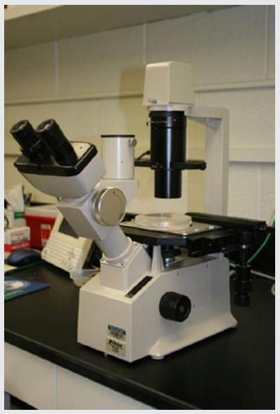
Firgure 1. An inverted microscope has a light source above the stage while the objectives are mounted on a nosepiece below the stag.

and if needed specific areas of the cultures can be marked for more detailed examination later on a