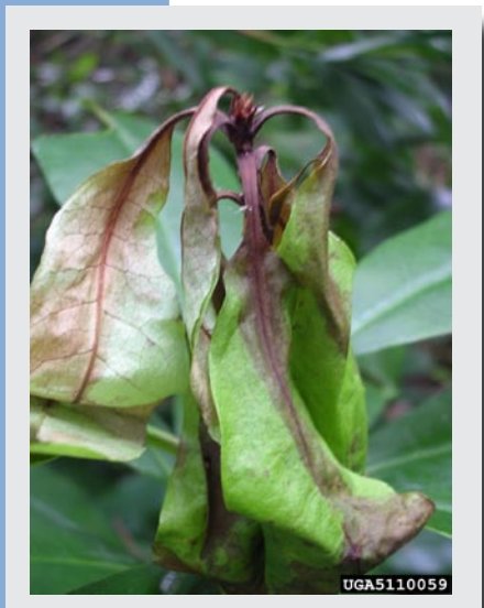
Symptoms of P. kernoviae infection on an azalea

The complete Federal Register posting as well as instructions on how to make comments can be accessed at <a href="http://www.regulations.gov/fdmspublic/component/main">http://www.regulations.gov/fdmspublic/component/main</a>.