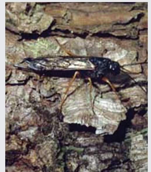
Adult sirex woodwasp.

NAPPO Phytosanitary Alert System: Detection of Sirex noctilio Fabricius (Sirex woodwasp) in Lamoille County, Vermont – United States