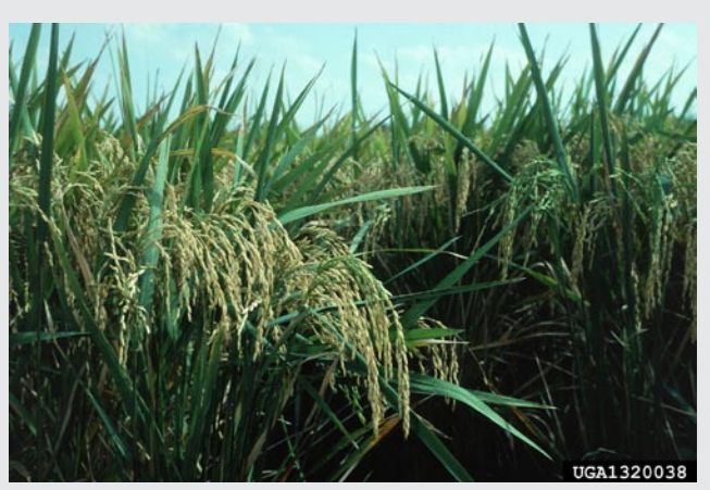
Rice, Oryza sativa L. One of the hosts for the Panicle Rice Mite.

Arkansas (September 7) and New York (September 14).