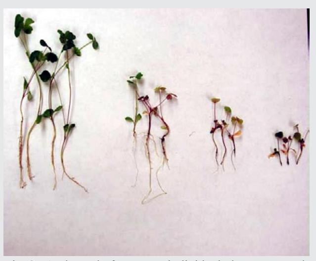
Fig. 3: At the end of an assay, individual plants are rated on a scale of 1 (healthy) to 5 (dead). Typical plants that would be rated with scores of 1 (left) to 4 (right) are shown in this photo.