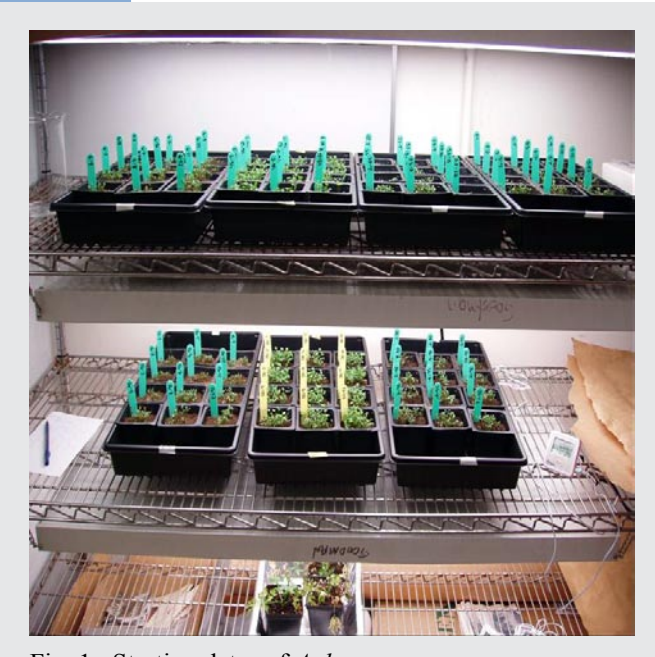
Fig. 1: Starting dates of Aphanomyces race surveys are staggered so that assays at a variety of stages are always in progress at the PDDC. Assays are conducted on light carts at ambient temperature (~24 C).

The following describes an assay that we use at the Plant Disease Diagnostics Clinic (PDDC) in an effort to determine which (if any) races of Aphanomyces euteiches are present in a soil samples collected from alfalfa production areas. Currently, two races of Aphanomyces euteiches (designated race 1 and race 2) have been documented on alfalfa. This assay also provides information on the presence of Phytophthora megasperma f.