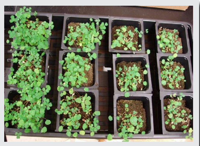
Fig. 2: At the end of an assay, differences in plant growth are typically visible. Substantial stunting and plant mortality can occur in some varieties/breeding lines.

After two weeks, we stop adding water and allow seedlings to incubate one additional week, only adding water if the trays are completely devoid of water.