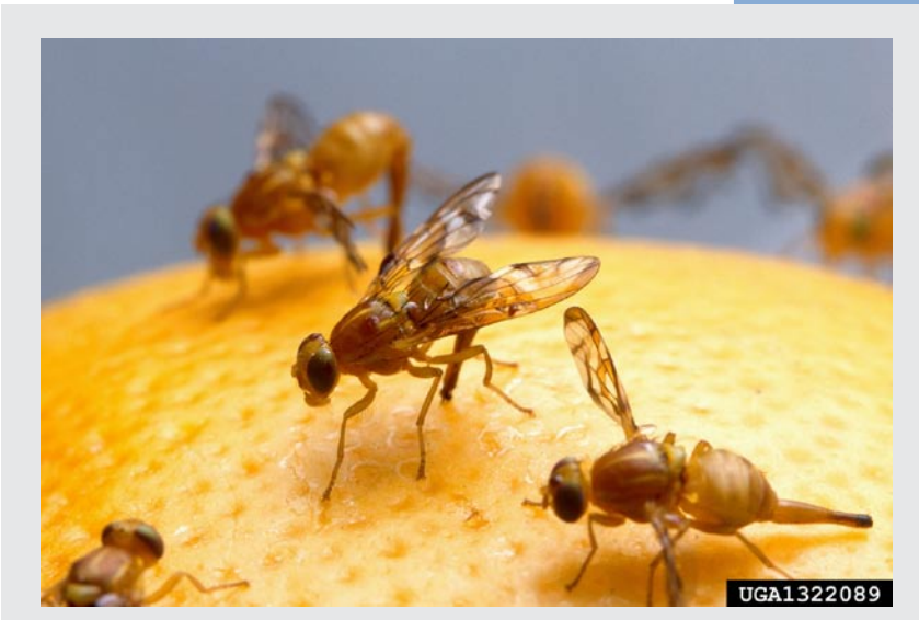
Adult Mexican fruit flies on a grapefruit.

NAPPO Phytosanitary Alert System: <u>Anastrepha ludens</u> (Mexican fruit fly) <u>- Quarantined Area in Willacy County,</u> Texas – United States