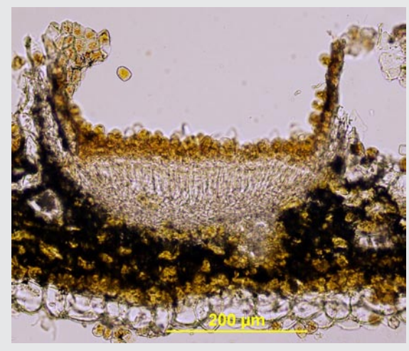
Figure 5. General fungal structures that can be viewed from samples.