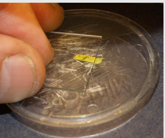
Figure 2: Slide placed on top of leaf section.