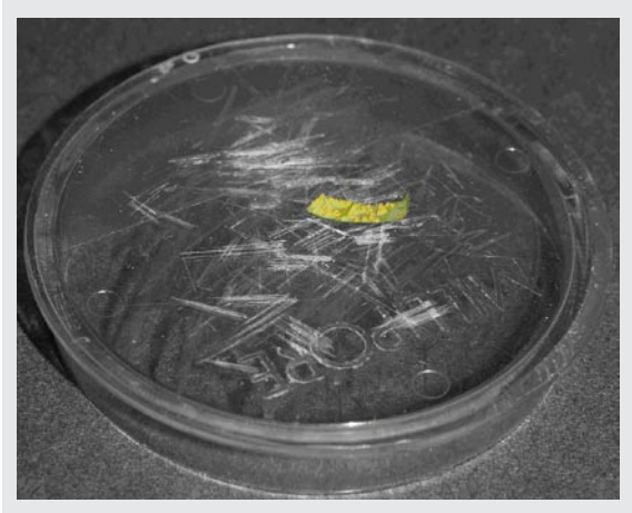
Figure 1: Section of leaf on plastic Petri dish scored with a razor blade.

moving the slide back from the edge with each cut (Figure 3).