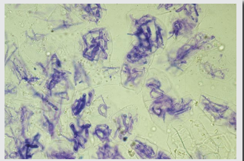
Mycorrhizae stained in roots viewed by clearing and staining roots.