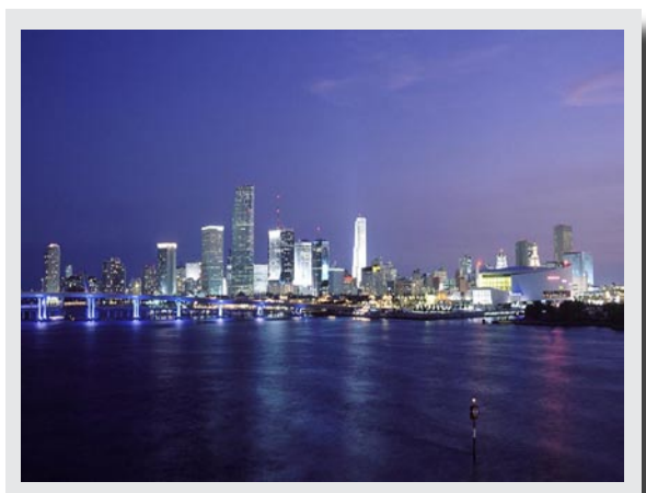
Miami, Florida: The site of the 2009 NPDN National Meeting.