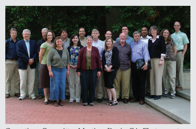
Operations Committee Meeting, Davis, CA.

NPDN participants included regional directors and associate directors, regional center staff and at large representatives, members of the Center for Environmental and Regulatory Information Systems (CERIS, Purdue), and representatives from the USDANIFA, ARS, APHIS, and the California Department of Food and Agriculture