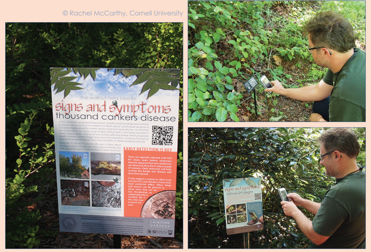
SPN's interpretive signage series consists of three pictoral signs: a comprehensive sign, one on signs and symptoms and another featuring host plants. Five regionally significant threats are available including sudden oak death, thousand cankers disease, laurel wilt, emerald ash borer and Asian longhorned beetle. Each sign includes a quick response (QR) code which takes one to SPN's new mobile webpages - one for each threat. SPN members can download the signage templates, customize them with their garden's logo and have them produced at a local sign shop.

This wraps up phase II of the SPN project but stay tuned...SPN will gear up for a third phase with new educational materials and workshops beginning in late fall. The Sentinel Plant Network is funded by USDA-APHIS through Section 10201 of the Farm Bill. For more information on SPN, visit www.sentinelplantnetwork. org or contact Rachel McCarthy at Rachel.McCarthy@ cornell.edu.