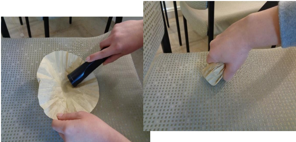
Fig. 2.2. Coffee filter sampling. Wrap coffee filter over end of vacuum cleaner hose, hold firmly, and vacuum location for specimens. When you see a disk of dirt caught by the filter, turn off vacuum cleaner, put coffee filter into a Ziplock bag, seal, and label with location, time, and date.