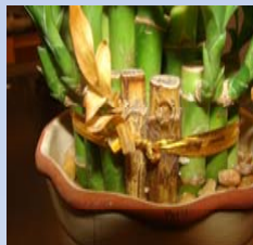
Anthracnose of lucky bamboo Colletotrichum dracaenophilum