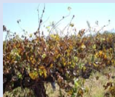
Pierce's disease Xylella fastidiosa of Grape