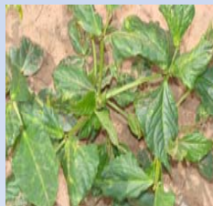
Tomato Spotted Wilt Virus of Cowpea