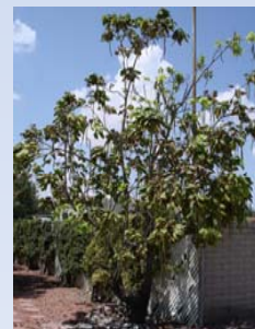
Northern Catalpa infected with Xylella fastidiosa