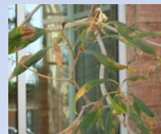
X Chitalpa tashkentensis infected with Xylella fastidiosa