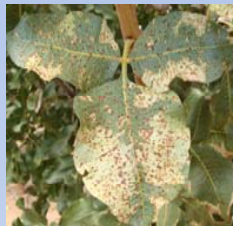
Advanced symptoms of Septoria leaf spot