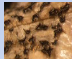
Setae of Colletotrichum dracaenophilum