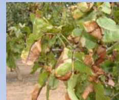
Alternaria late blight foliar symptoms